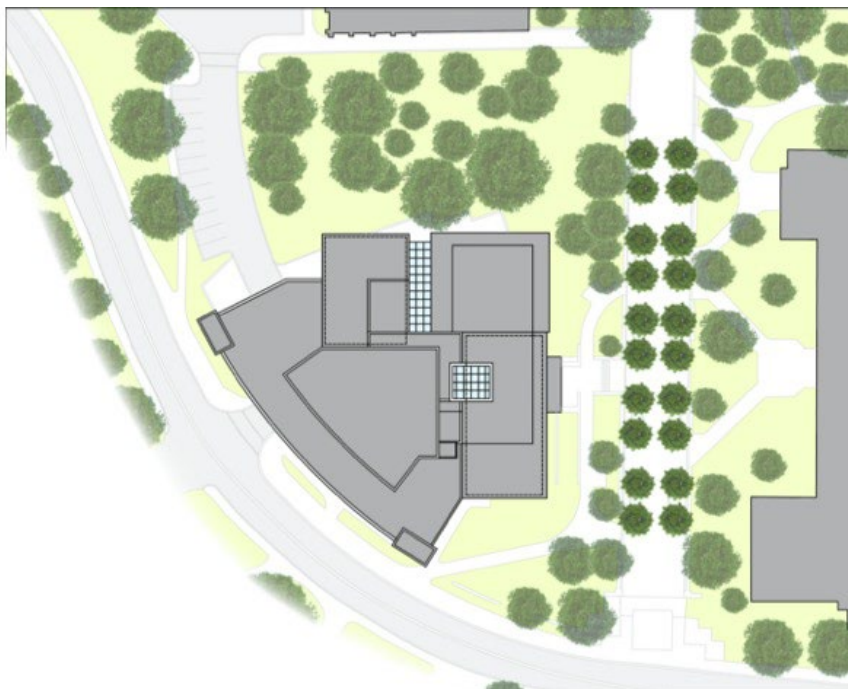
Figure 2: Clinic site plan showing entrance on right off pedestrian promenade

The design team was interested in several goals that are often associated with salutogenesis, such as acknowledging the role of nature in promoting health and well-being. The clinic participates in the ParkRx program in which students are given a prescription to interact with nature as part of their treatment. (See Kondo, et al., (2020) for a description of the ParkRx program.) Figures 2, 3, 4 and 5 provide a site plan and exterior views.