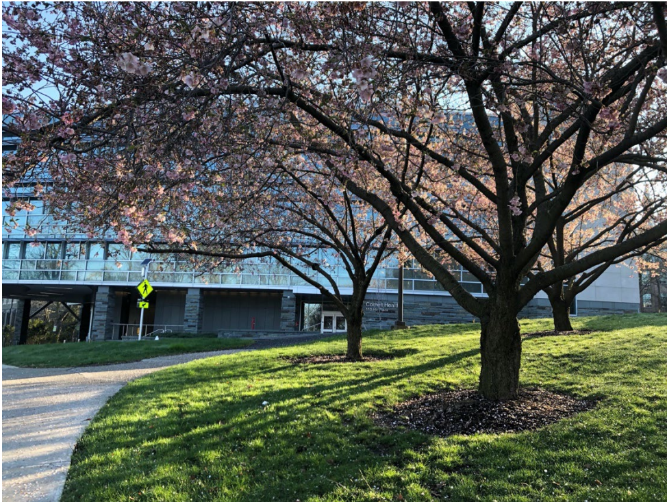
Figure 4: Approach to health building from the south