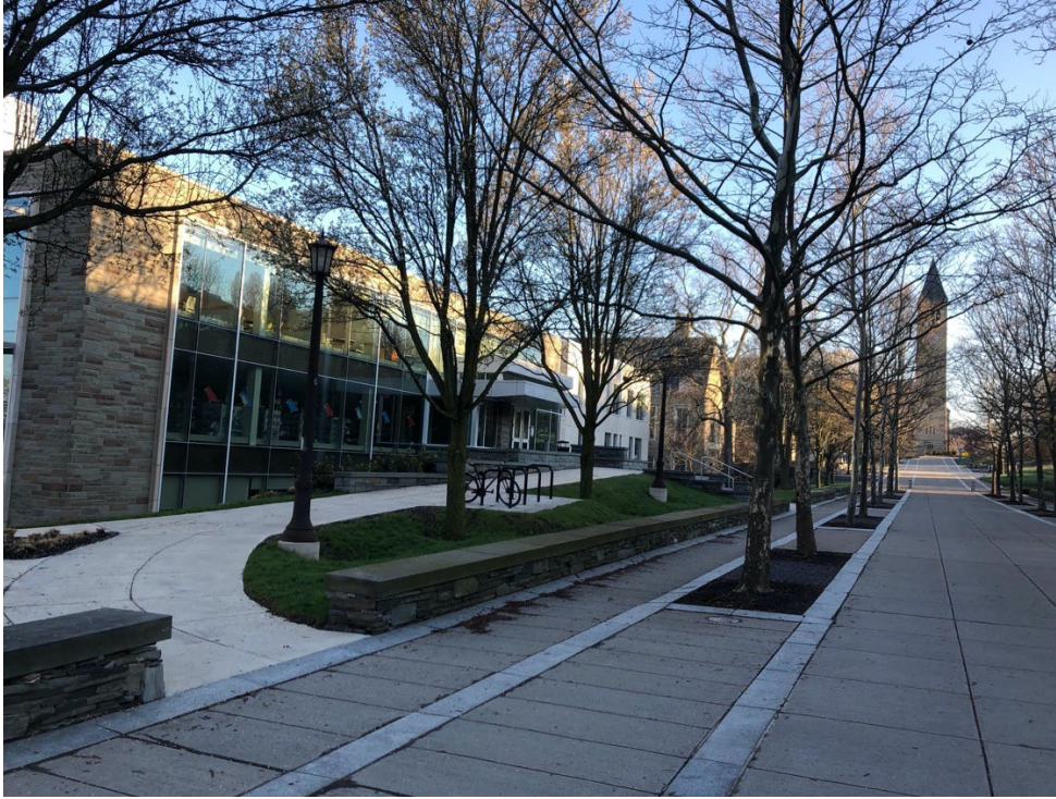
Figure 5: Pedestrian plaza showing bike racks and pedestrian seating