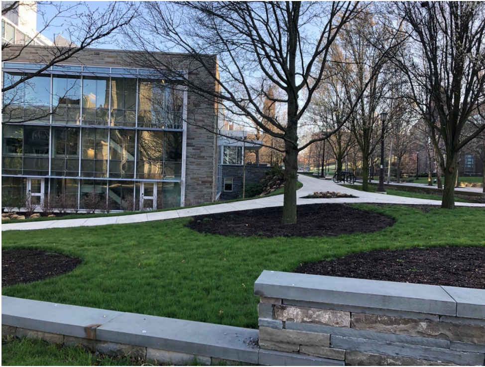
Figure 3: Approach to health building adjacent to pedestrian promenade